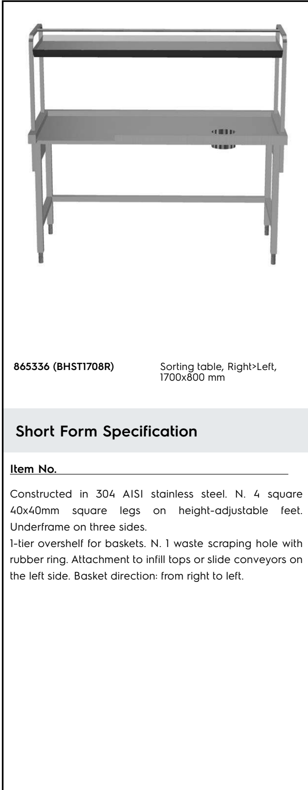
865336 (BHST1708R) Sorting table, Right>Left, 1700x800 mm